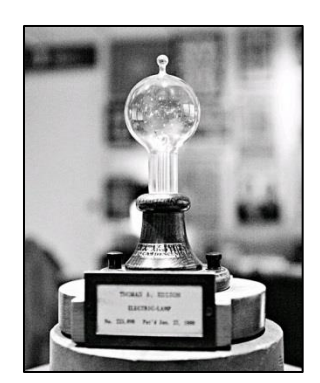
February 1847 – October 1931