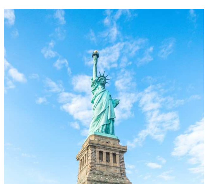
The Statue of Liberty holding a _____ greets visitors.