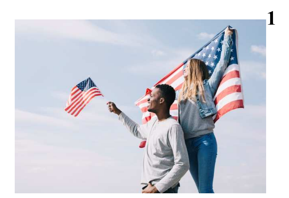
The American is red, white and blue.