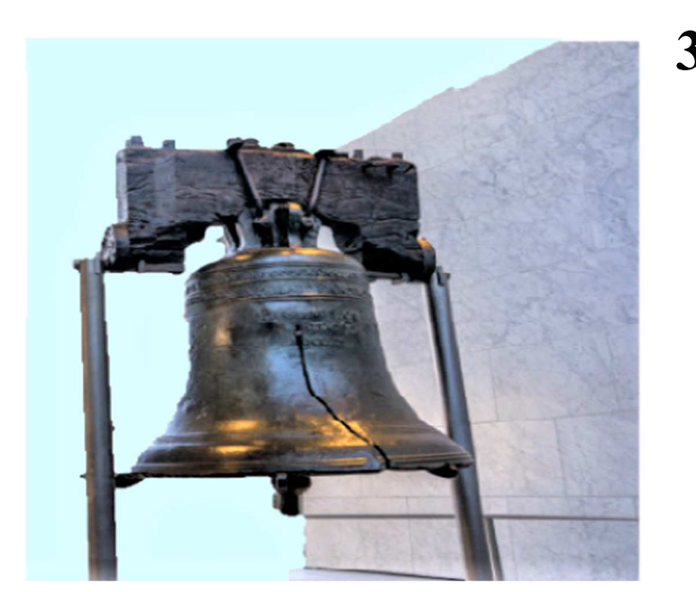
The Liberty hangs in Philadelphia, Pennsylvania.