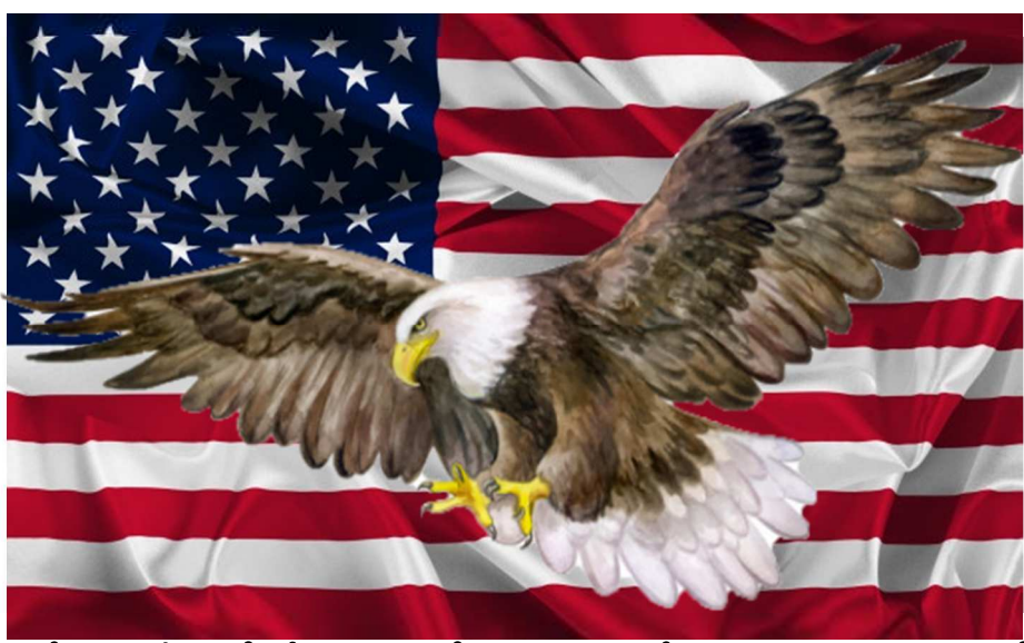
The bald eagle is the national of America.