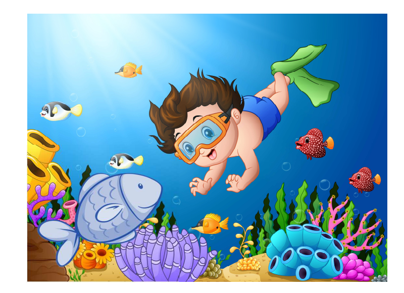
A blue fish can see me.