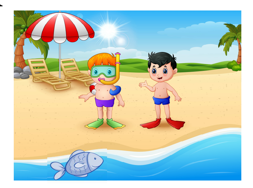
I see a blue fish.