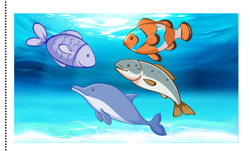
Three fish said hello.