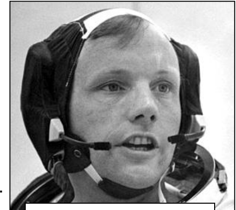
August 1930 - August 2012