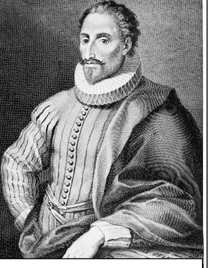
September 1547 – April 1616