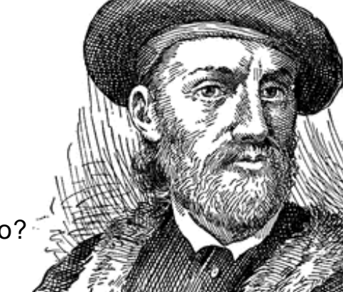
1254 – January 1324