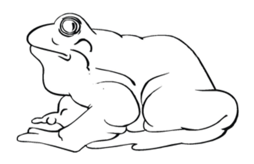
A frog is green.