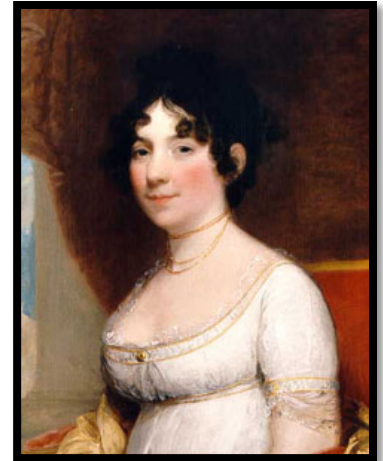
May, 1768 - July, 1849