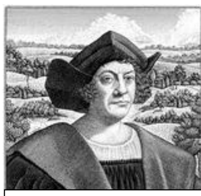
October, 1451 - May, 1506