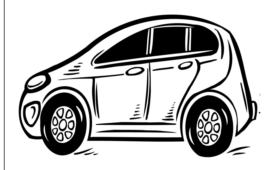
My car is purple.