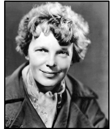
July, 1897 - January, 1939

Amelia soon took flight lessons in California and quickly became a skilled pilot. In 1920, Amelia bought her first plane naming it "The Canary". After just two years of flying planes she was already attempting to break records. Amelia broke the woman's altitude record of 14,000 feet, became the first woman to fly solo across the Atlantic Ocean, broke speed records and was the first woman to fly solo coast to coast. Amelia Earhart was also involved with